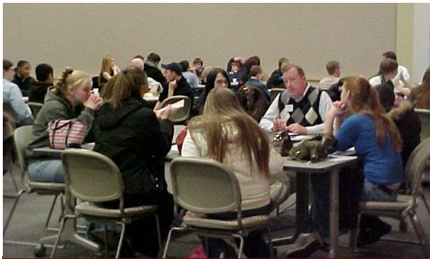
Below: Ethics Day 2008

"It's not what is poured into a student, but what is planted."