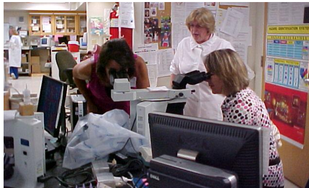
Below: The Practicum Summer 2008

"I hear, and I forget. I see, and I remember. I do, and I understand."